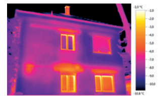
Thermal image with ScaleAssist